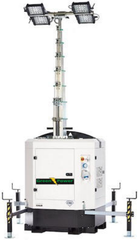
The images are only for demonstration purposes